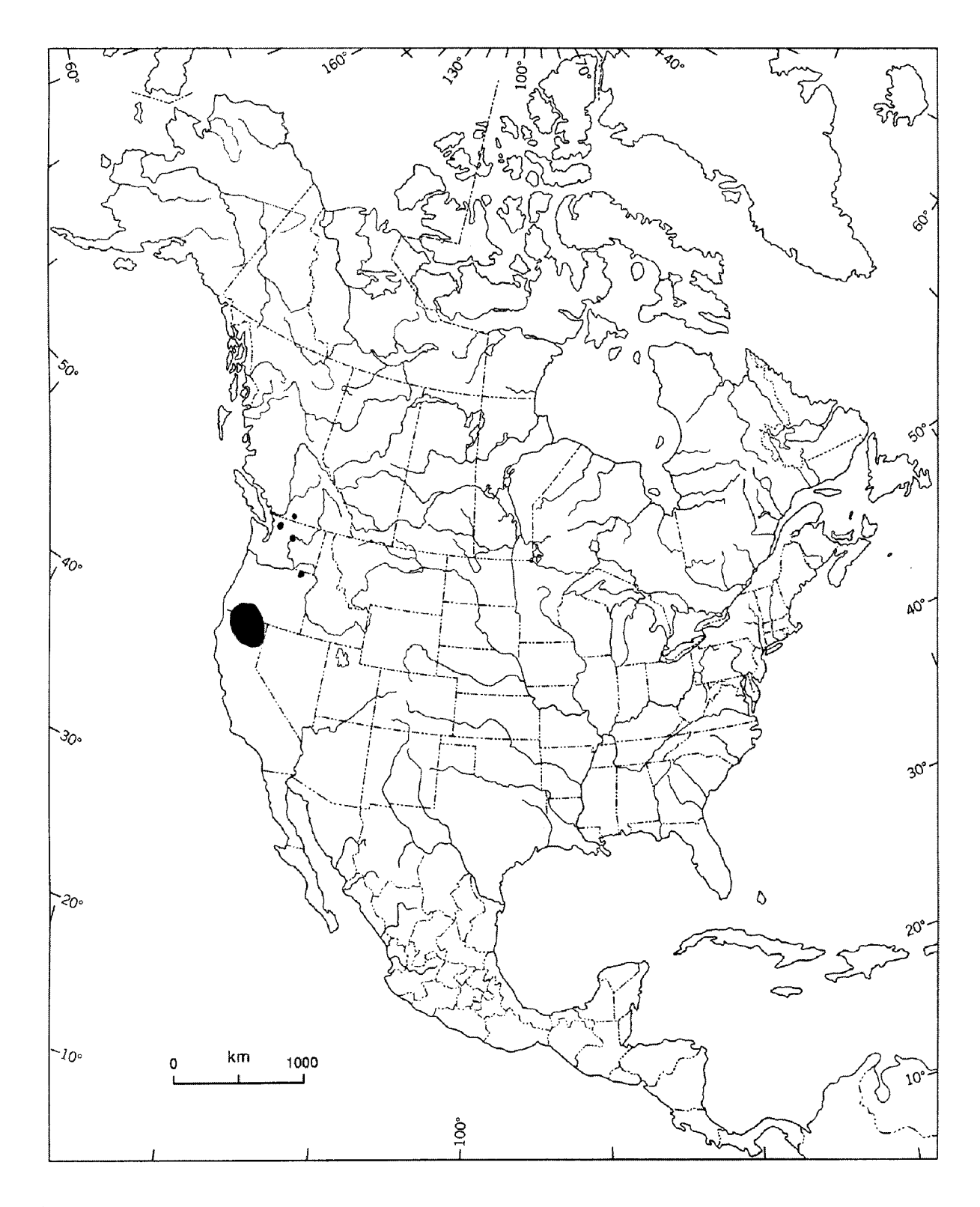
Figure 2. North American range of Lemmon's holly fern (Douglas 2003).